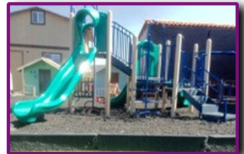
Children's play area