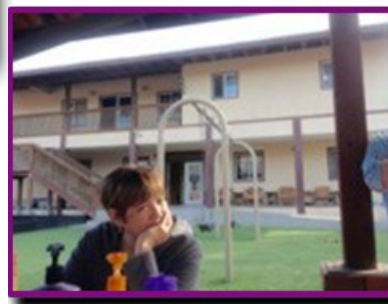
Deborah's House living quarters