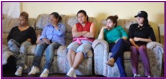
Some residents of Deborah's House

Love Gift has been an arm of ABW since 1931. It continues to help many through International Ministries. The need is world wide. Use your creativity to find new ways to collect for Love Gift. (Love Gift flyers, boxes, and envelopes are available through Valley Forge. They are free except for shipping.)