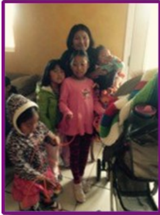
One family receiving help